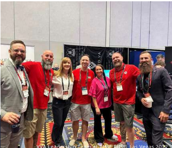
VVA Leadership Team at AIME FUSE, Las Vegas 2022

Make sure your selling agent is aware of these options: the VA's Tidewater process and Reconsideration of Value. This is a great opportunity to provide an appraiser with additional support information backing your asking price.